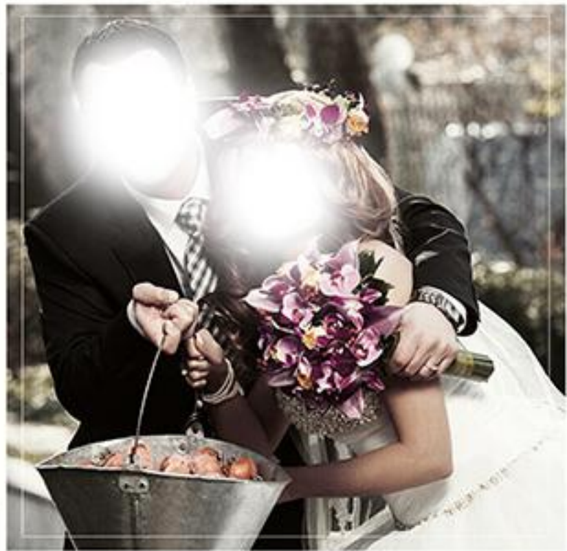
My Romantic Wedding